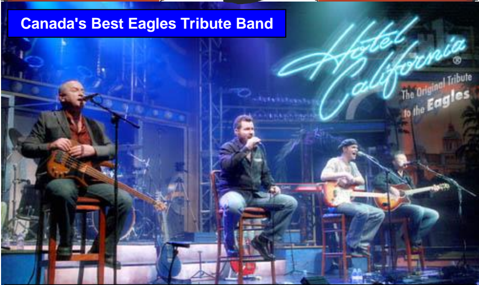
So good, you'd swear Don Henley was in the room singing!

The Original Tribute to THE EAGLES , Hotel California prides itself on creating the illusion that you are listening to the actual Eagles. They've shared the stage with the Doobie Brothers, Lynyrd Skynyrd, Styx, REO Speedwagon and many more International Artists. They've performed in Dubai, Japan, India, Bermuda and all over North America and now they are performing in Victoria Harbour! Don't miss this outstanding show!